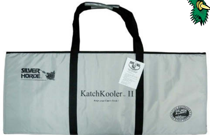
Katch Kooler II Sale Price $29.95 Reg. Price $39.95