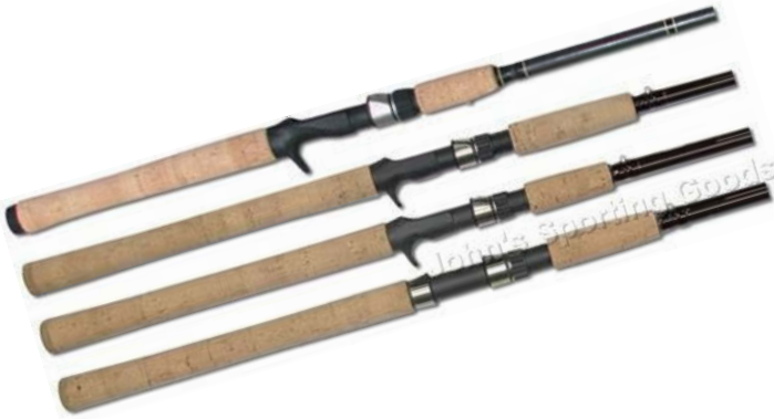
Lamiglas Classic Glass Series Sale Price $79.50 Reg. Price $99.50