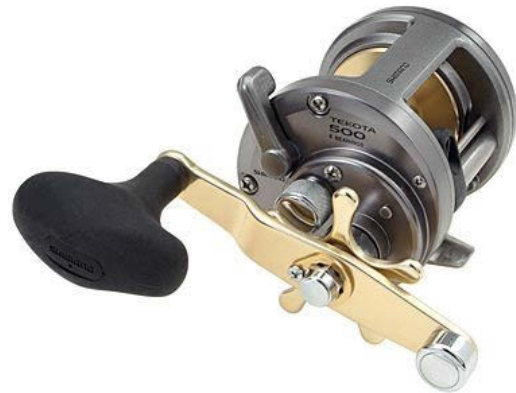
Shimano Tekota 500/600 & 500LC/600LC Price $149 Reg. Price $165-$175