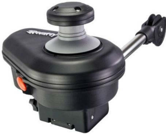
Scotty 2500 Pot Puller Price $399.00 Reg. Price $499