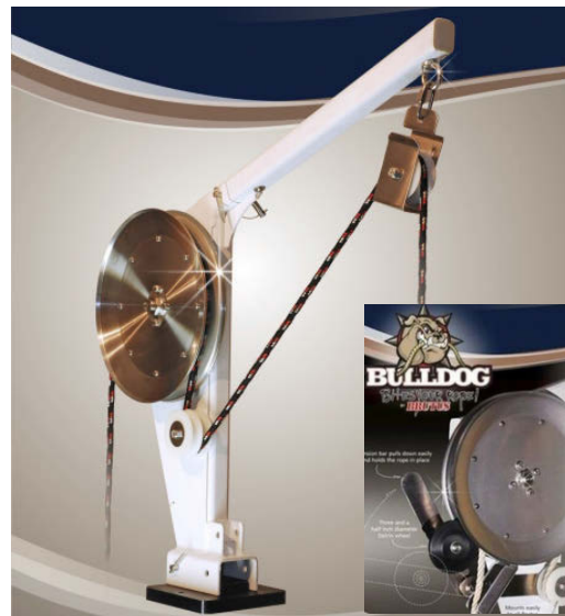
Ace Line Hauler Special Price $525 w/Free Bull Dog-$70 Savings Free Shipping on this Item