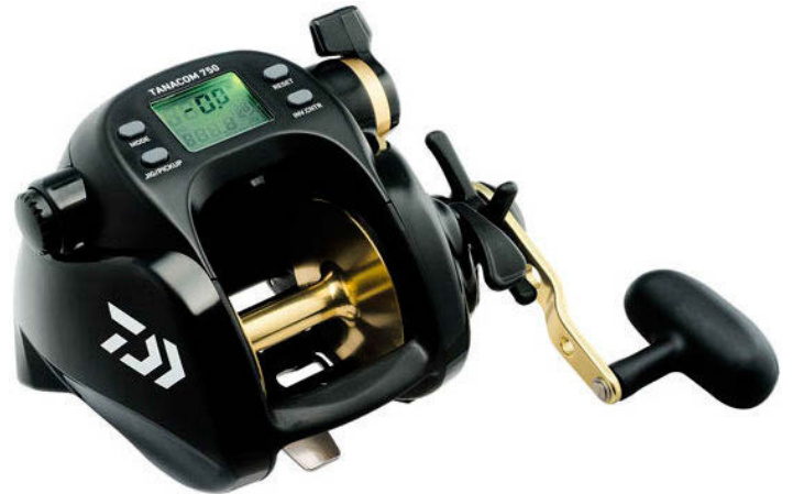
Daiwa Tanacom 750 Sale Price $549 Filled Free w/65lb-80lb Braided Line

No Coupons or Discount Gift Certificates can be Used on these On-Sale Items