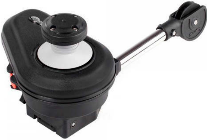
Scotty 2500 Pot Puller Sale Price $399