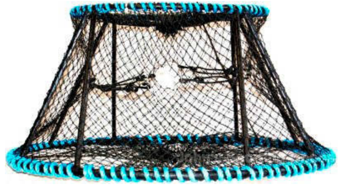
Ladner Style Shrimp Pot Medium Size $79 Large Size $89 Reg. Price $89-$119