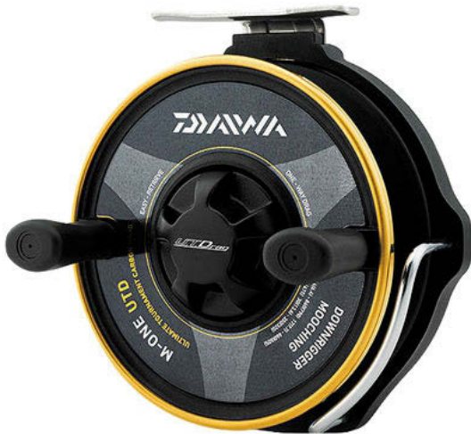
Daiwa M-One Mooching Reel $59.95 Reg. Price $79.50