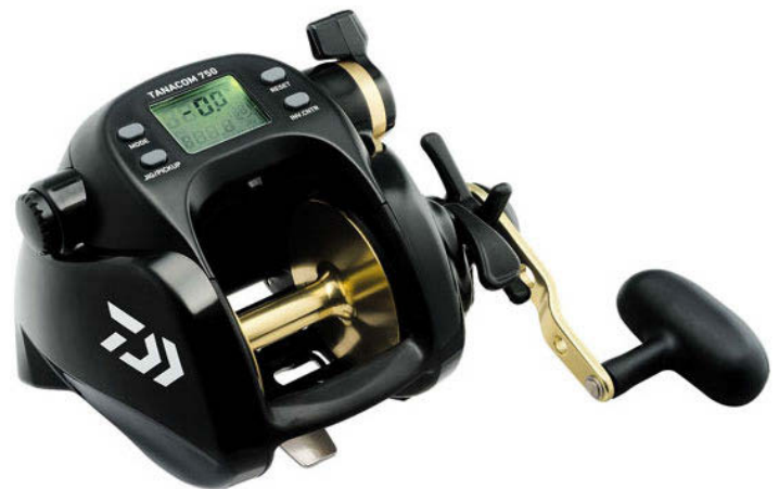
Daiwa Tanacom 750 Sale Price $549 with free 65 or 50 Braided Line

No Coupons or Discount Gift Certificates can be Used on these On-Sale Items