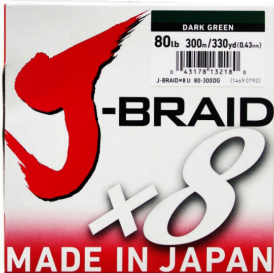
Daiwa J Braid 65lb & 80lb 65lb-$19.95 80lb $23.50 330 yard spool