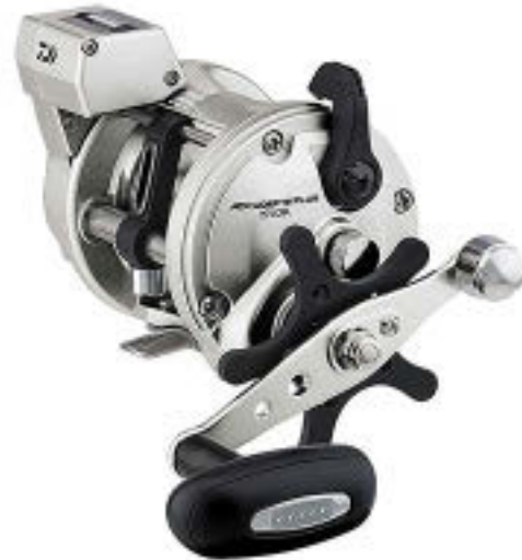
Daiwa ACCUDEPTH 27LCB Right/Left Hand $69 w/free line Reg. Price w/line $81